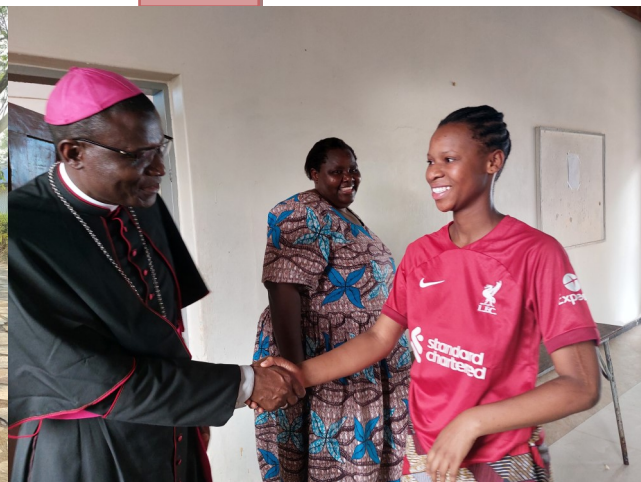
THE NIECE TO THE BISHOP