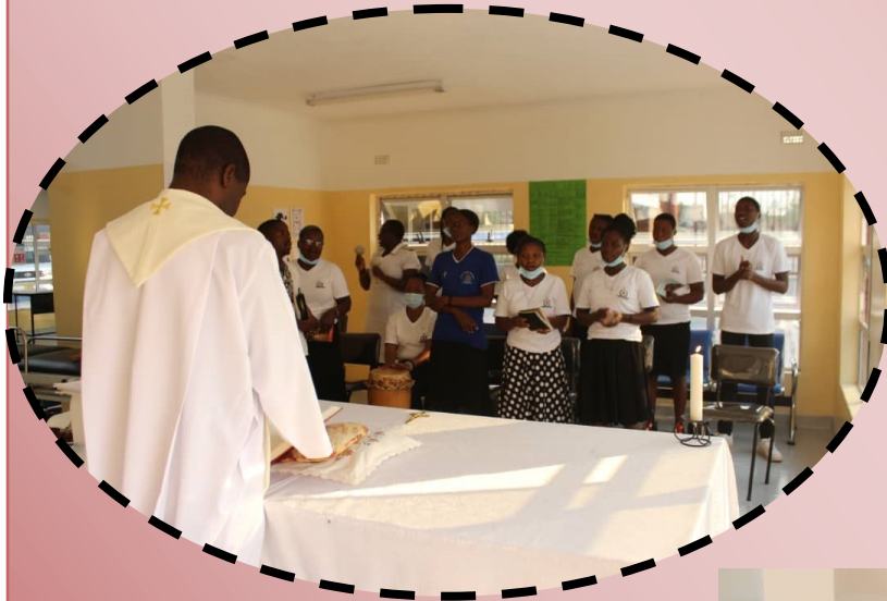
The clinic staff during Mass