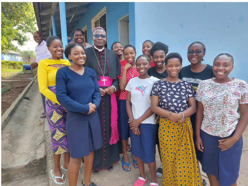
THE BISHOP INTERACTS WITH THE PUPILS